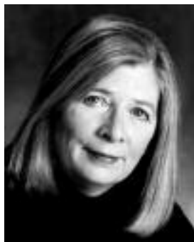
Morning Keynote Speaker Barbara Ehrenreich