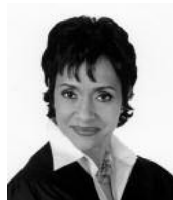
Luncheon Keynote Speaker Judge Glenda A. Hatchett